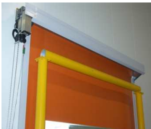
Durable solid steel construction