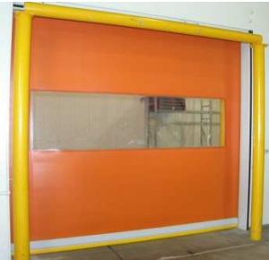
MAX Doors TOUGHFLEX® door curtain